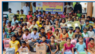
Intervention towards disabled, HIV/AIDS